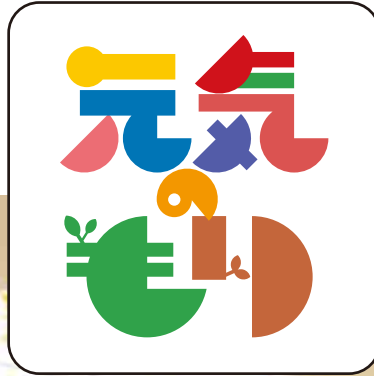
Genki no Mori